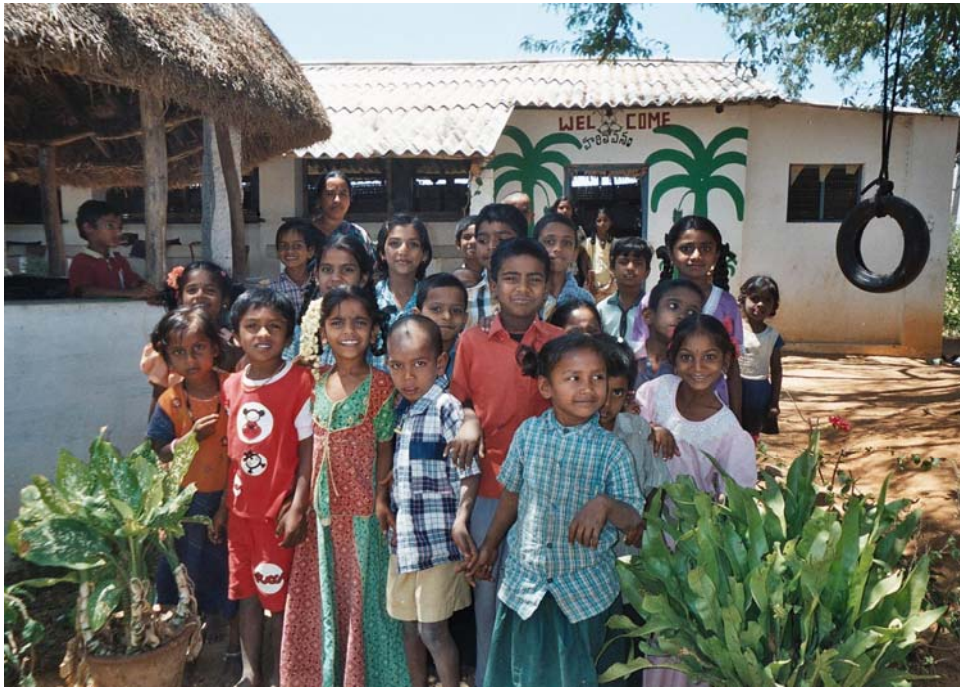
Photo 1: Students outside RIVER school, Chittoor District, Andhra Pradesh