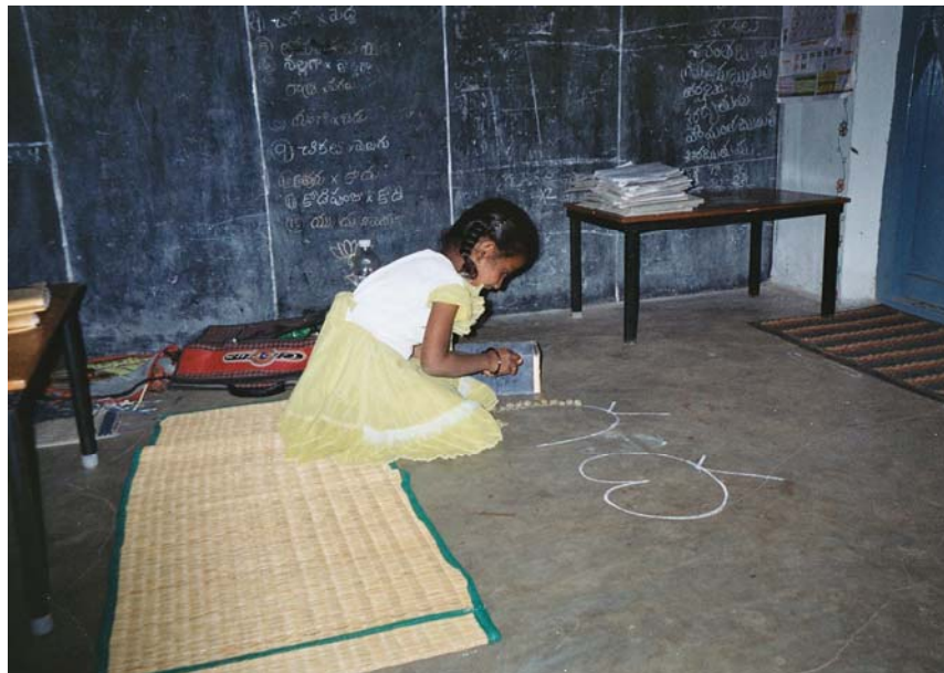
Photo 2: Student completing self-led learning activity, RIVER school, Chittoor District, Andhra Pradesh