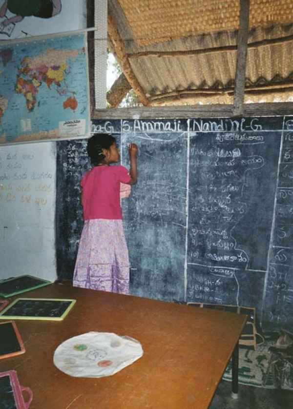
Photo 3: Student writing on her personal blackboard space, RIVER school, Chittoor District, Andhra Pradesh