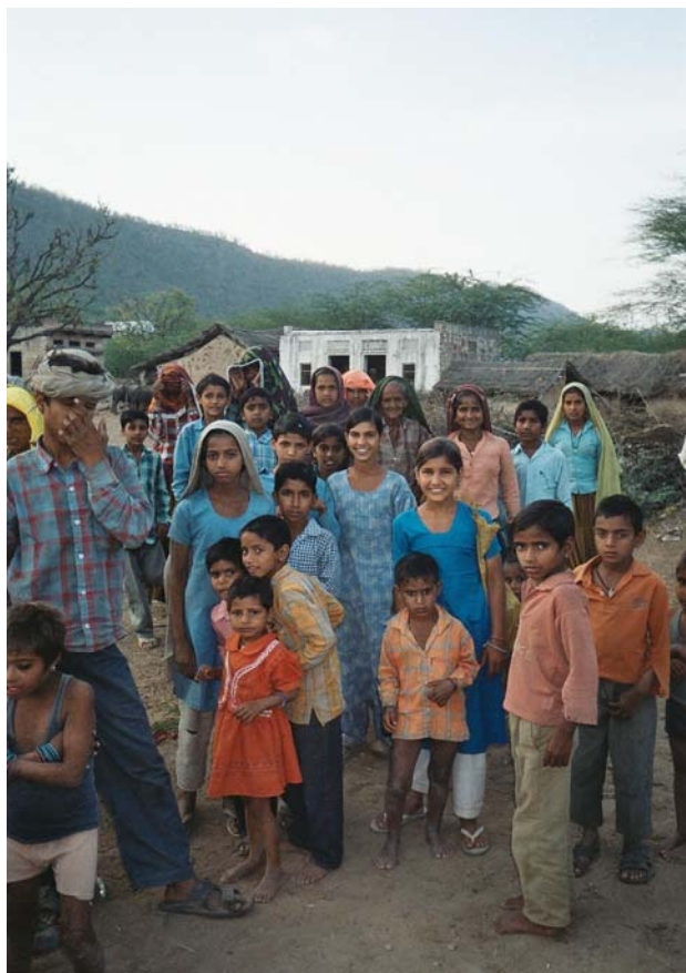
Photo 5: Students and parents from government school (above), Alwar District, Rajasthan