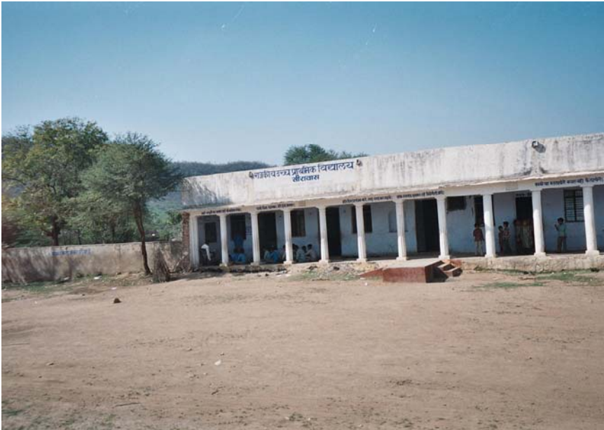
Photo 4: Government school supported by Bodh Shiksha Samiti, Alwar District, Rajasthan