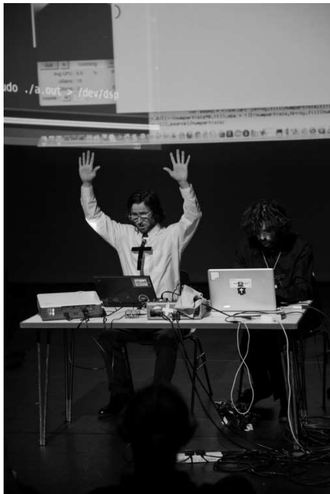
Figure 2. Wrongheaded preaching code at the Arnolfini in Bristol.