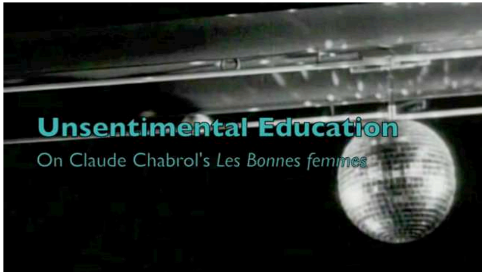
Figure 1: Screenshot from Unsentimental Education (Catherine Grant, 2009)

“[T]here is always a personal edge to the mix of intellectual curiosity and fetishistic fascination.” (Mulvey 2006, 145)