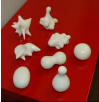
Figure 1. Sensual Evaluation Instrument (SEI) objects

during and after evaluations of interactive systems. These playful self-reports capture UX in a holistic way. This kind of evaluation is without too much interference with the users' experiences as in the case of classical methods (e.g. questionnaires, physiological measures).