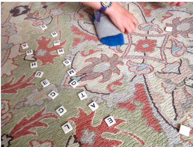
Figure 2. Photograph taken by Sevasti-Melissa Nolas of Alessio playing his 'voting game'.

After we've played noughts and crosses a number of times Alessio wanders over to the box of toys as if looking for something else to play. He takes out a banana pouch containing lots of