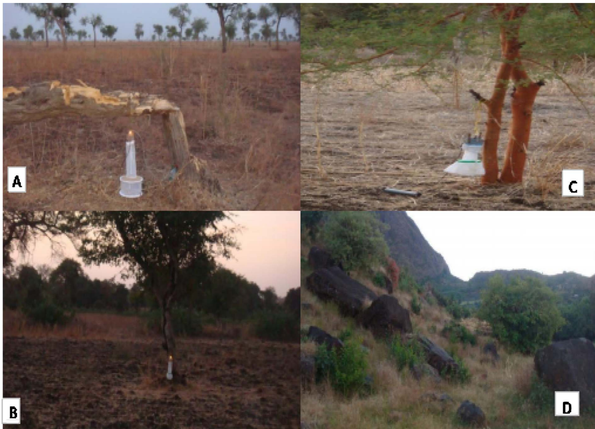
Fig. 2. Sand flies collection sites from Humera to Gondar transect.

A) Adebay(Sesame farm), B) Soroka(Rice field), C) Ashere(Acacia trees), D) Tikil-Dingay(Hyrax habitat).