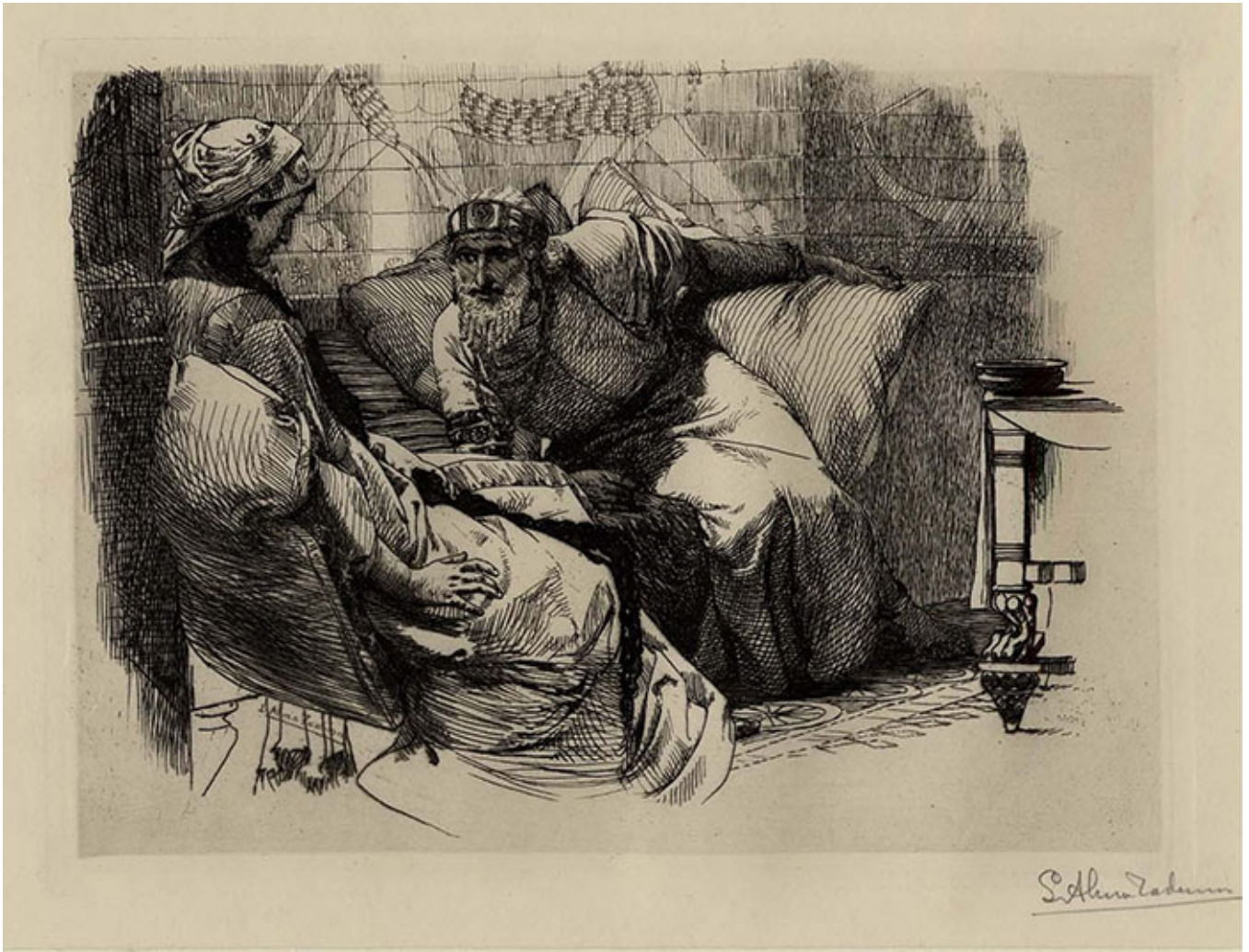
Figure 5: Alma Tadema, Zal and Rudabeh, etching, 1882 (148 mm x 203 mm,)