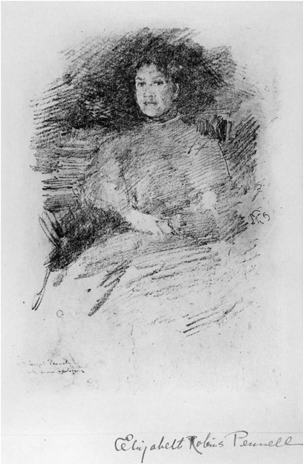
Figure 4: James McNeill Whistler, Firelight: Elizabeth Robins Pennell (1896, Library of Congress)

Robins Pennell continually condemned the poor showing of "black and white" or print artists at the Royal Academy and the fact that Whistler's work was not represented in London collections. Whistler's work had not been selected for the nation as part of the Chantrey Bequest. Whistler reciprocated this support in 1897 when