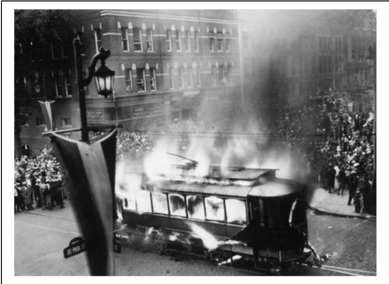
Figure 1. A “funeral pyre” for an Electric Street Trolley in Vermont, 1929.