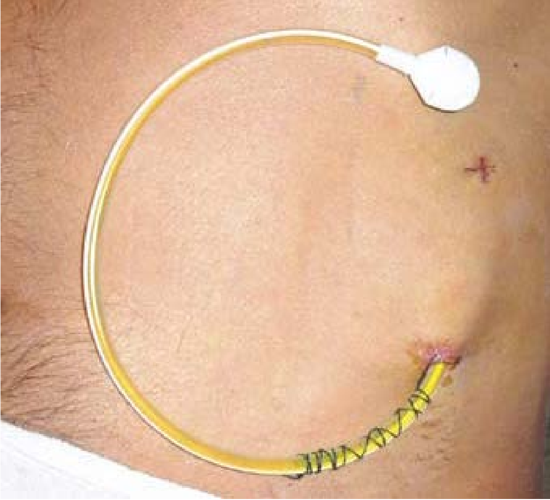
Figure 1 Rocket Long-Term Abdominal Drain in situ [26]